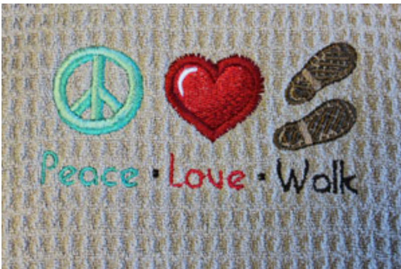
Solid-fill designs are a good choice for microfiber.

The photo on the left shows the design when it's stitched without a topping. Notice how some of the stitches are getting lost in the fabric. The result is a less crisp stitchout. The support of topping will keep the stitches looking sharp.