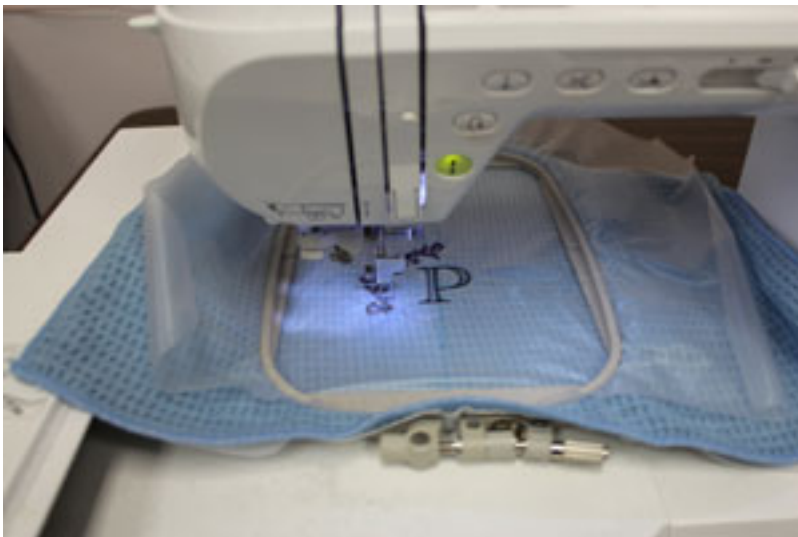
A topping keeps the stitches from sinking into the fabric.

When working with stretchy fabrics, like microfiber, steer clear of tear-away stabilizer. Tear-away stabilizer is designed to "tear away" quickly after embroidering. But the needle perforations actually begin to disintegrate the stabilizer during embroidery, leaving nothing behind to support the fabric. That means that the fabric is free to stretch and warp as the hoop moves, resulting in skewed and misplaced stitching. For best results, use cutaway stabilizer.