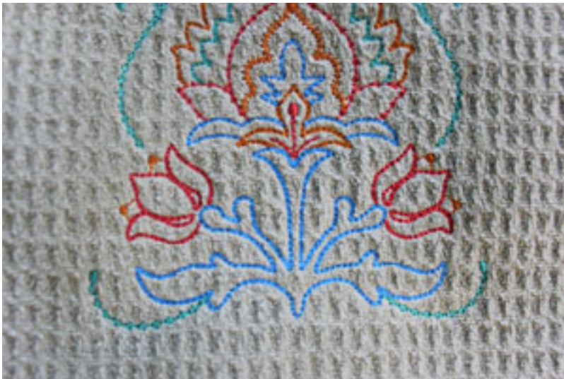
Stitches are nice and crisp when a topping is used.