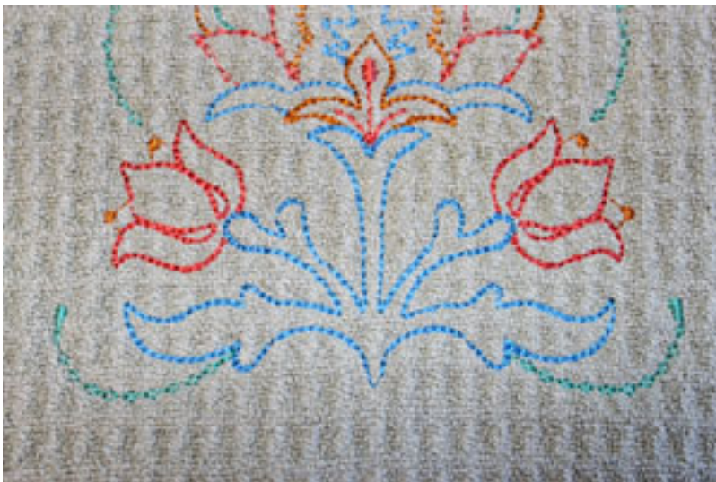
Without topping, stitches can look a bit fuzzy and less distinct on microfiber.

I embroidered the Heritage Thistle design with cutaway stabilizer and topping, and then again without topping. The design embroidered with topping (shown left) is nice and crisp, and the stitches are not sinking into the fabric.