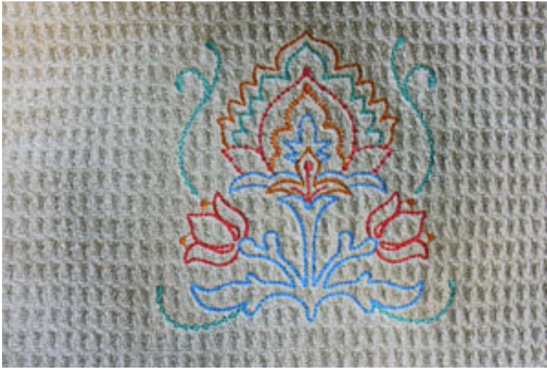
Medium-weight cutaway stabilizer helps the fabric hold its shape, and gives the stitches a solid base.