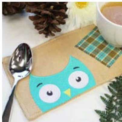
Sweet Patch Mug Rug

See below for other creative uses for on the edge designs, like placemats, mug rugs, fleece hats, baby bibs, bunting, and hooded bath towels!