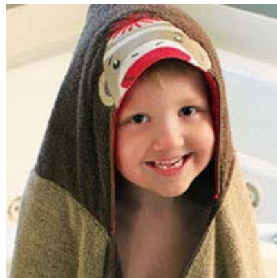
Hooded Bath Towel