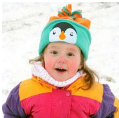
Animals on the Edge Hat