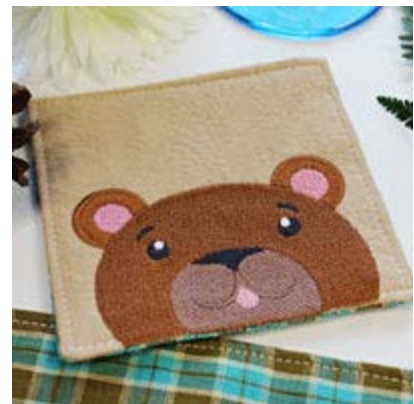
Cute and Cozy Coasters