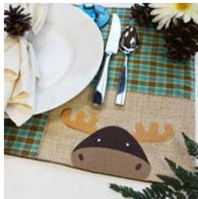
Wild and Woodsy Placemat