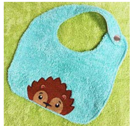
Baby Bib from Hand Towel