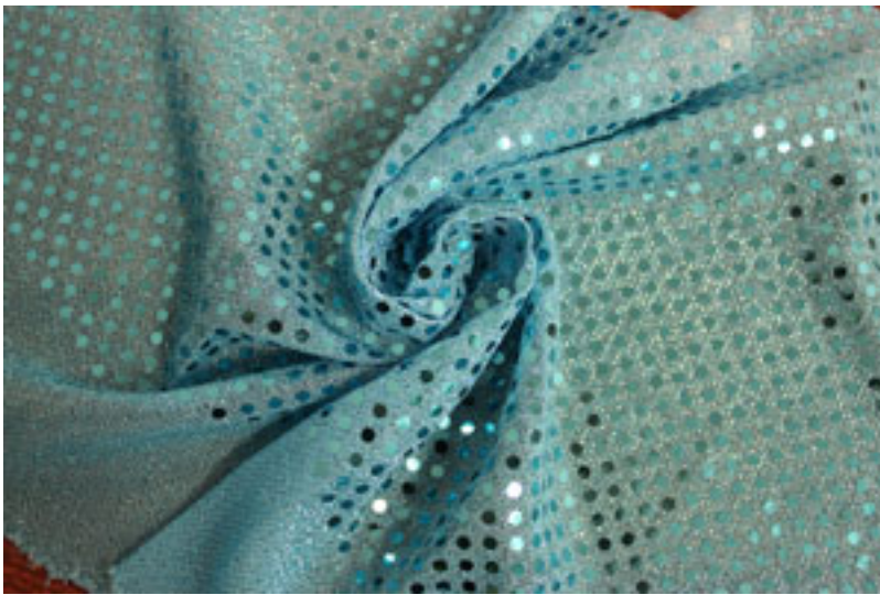
Confetti Dot is a stretchy, sheer fabric peppered with sparkling circles or dots.

The type of Confetti Dot fabric that I experimented with is a nylon and polyester blend. The sparkling dots themselves are usually made from plastic or Mylar, and are held to the fabric with a heat-reactant glue.